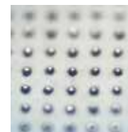
Conductive Epoxy, 50µm spot size