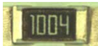
Conductive Epoxy Component Attach