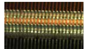
Ag 3D stacked-die interconnects